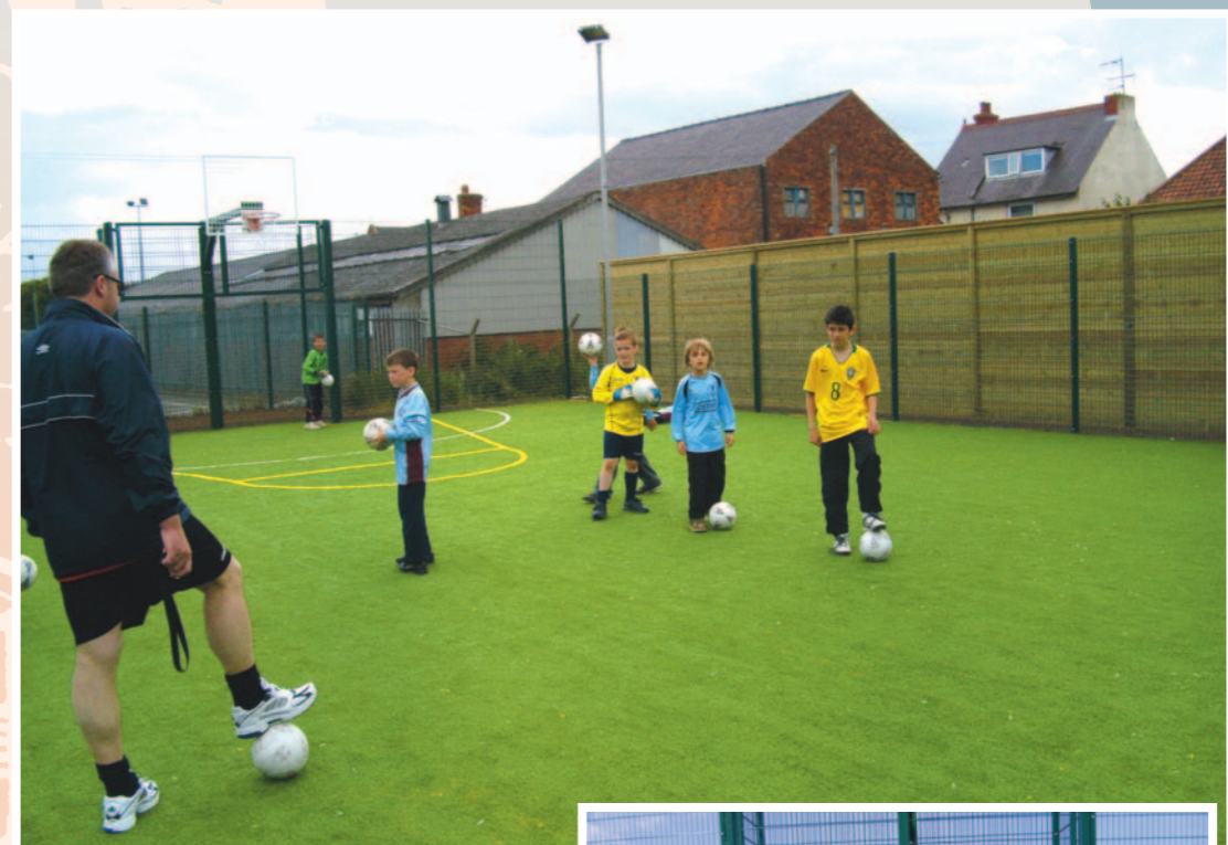
Rangers being coached at the new 'MUGA'

It is a privilege to serve you and the Town Council and I wish you well.