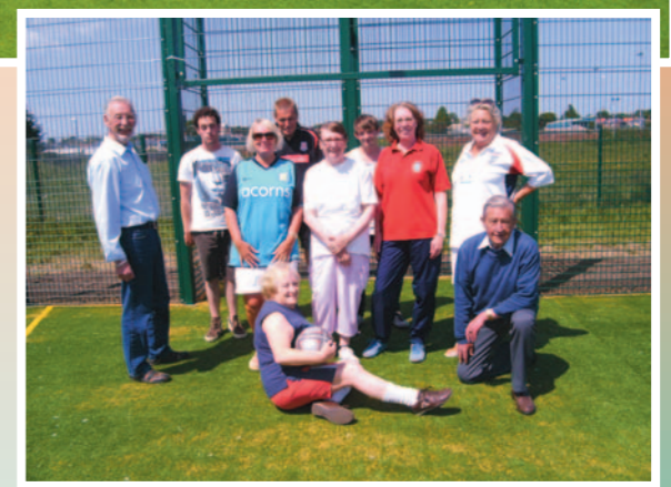
Town Councillors and future users of the new 'MUGA'

Parking is readily available and free in the evening. Although the Council is actively seeking additional free daytime parking.