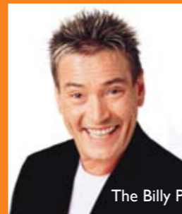
The Billy Pearce Summer show