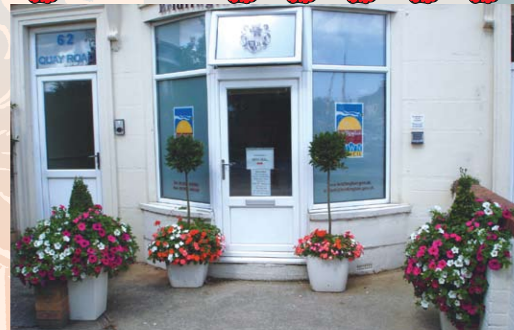
Town Council offices looking blooming marvellous for this year's national Coastal Category entry.