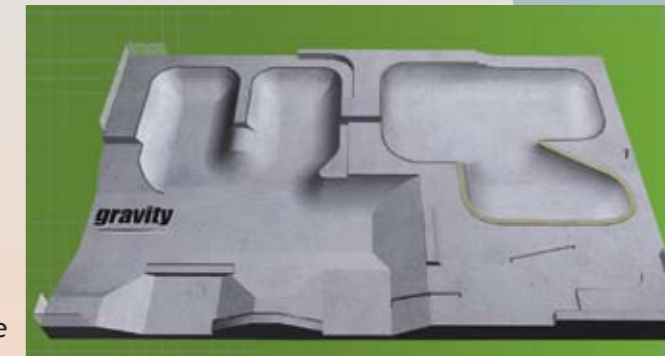
Graphic of the Gasworx skatepark under construction