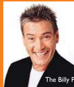
The Billy Pearce Summer show