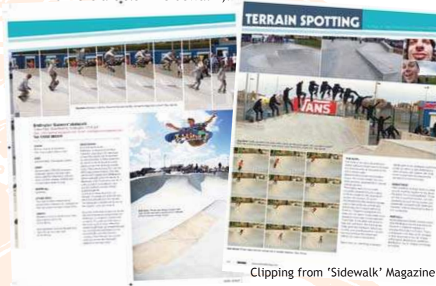
Clipping from 'Sidewalk' Magazine

Gasworx was the main feature in the June edition of 'Sidewalk' Skate Magazine and has been tipped as one of the best parks in the UK and no negatives could be found. (Pictures show clipping from the article in 'Sidewalk').