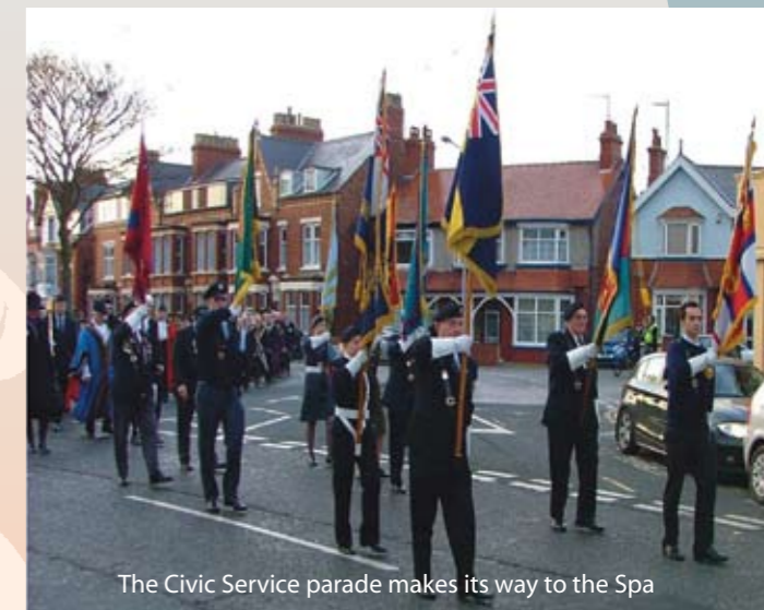
The Civic Service parade makes its way to the Spa