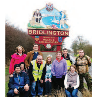
The walkers arriving in Bridlington.

The walkers would like to thank everyone who sponsored them and ask that all sponsors are encouraged to send in their monies as soon as possible and anyone willing to donate money to these deserving charities can do so by calling the Council Offices at 62 Quay Road, Bridlington YO16 4HX (not the Town Hall ERYC Offices) between 9.00am and 1pm Monday to Friday or contact the office on Bridlington 01262 409006.