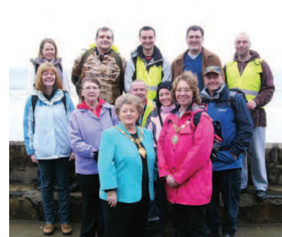
The Mayor of Scarborough set the walkers off from the Spa in Scarborough.